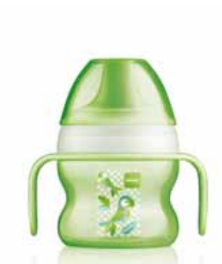
The ideal first cup. The extra light design with removable handles was developed especially for baby hands.